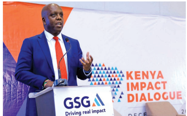
Ambassador Martin Kimani PhD, Director of Kenya's National Counter Terrorism Centre and Special Envoy for Terrorism Prevention